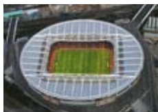
ARSENAL FC EMIRATES STADIUM LONDON UK