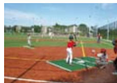
PIM MULIER SPORTPARK HAARLEM THE NETHERLANDS