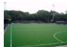
WAGENER-STADION AMSTELVEEN THE NETHERLANDS