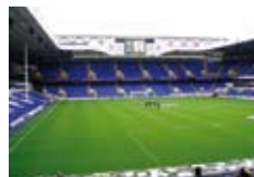
TOTTENHAM HOTSPUR WHITE HART LANE STADIUM TOTTENHAM UK