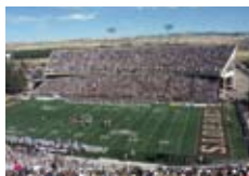
WYOMING COWBOYS UNIVERSITY OF WYOMING WYOMING USA