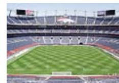
DENVER BRONCOS INVESCO FIELD AT MILE HIGH DENVER USA