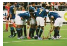
BRAXGATA NATIONAL HOCKEY CENTER BOOM BELGIUM