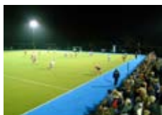
CHELMSFORD HOCKEY CLUB CHELMSFORD UK