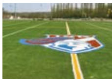
INTERNATIONAL SCHOOL BRUSSEL BELGIUM