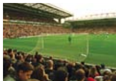
LIVERPOOL FC ANFIELD LIVERPOOL UK