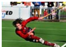
HC KLEIN ZWITZERLAND DEN HAAG THE NETHERLANDS