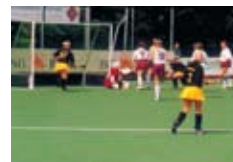
HC DEN BOSCH DEN BOSCH THE NETHERLANDS