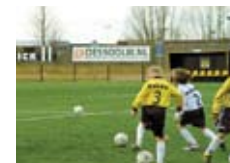
NAC RAT VERLEGHSTADION & TRAINING CENTRE BRED THE NETHERLANDS