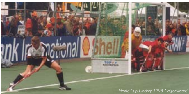
World Cup Hockey 1998, Galgenwaard