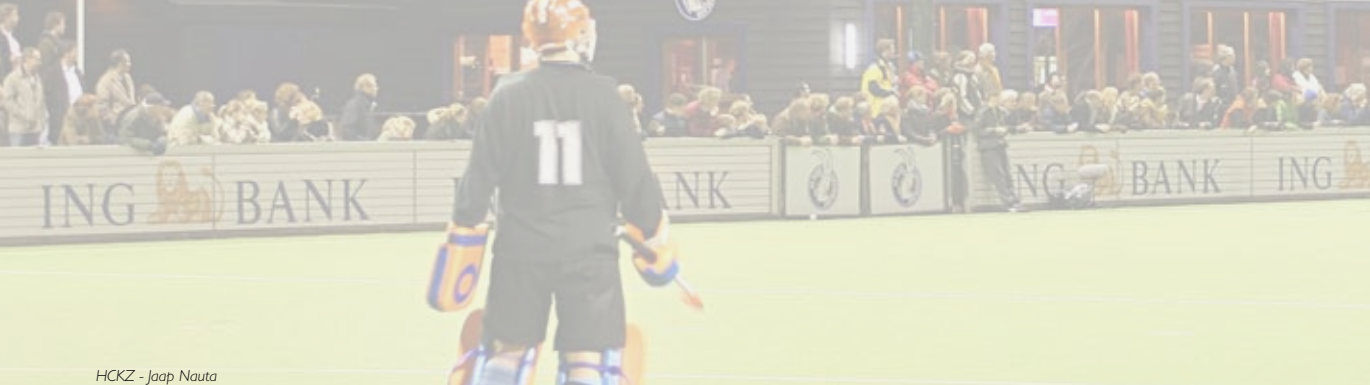
HCKZ - Jaap Nauta