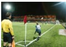
UMEA IK GAMMLIAVALLEN UMEA SWEDEN