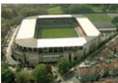
RSC ANDERLECHT CONSTANT Vd STOCK STADION & TRAINING CENTER BRUSSEL BELGIUM