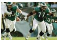
PHILADELPHIA EAGLES LINCOLN FINANCIAL FIELD STADIUM PHILADELPHIA USA