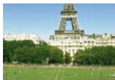
STADE EMILE ANTOINE PARIS FRANCE