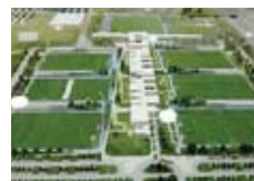
REAL MADRID TRAINING CENTRE MADRID SPAIN