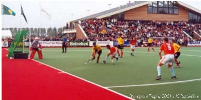
Champions Trophy 2001, HC Rotterdam

One watering session is all that is required for the entire game. Desso Dynamix is therefore the logical choice for the investor or club wanting to reduce both their energy costs and environmental footprint. It's also ideal in areas where water is scarce, but clubs still want to train and play on a high quality water-based pitch.